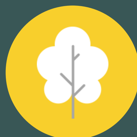
Parks and Recreation