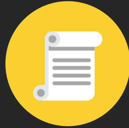
Communications/ City Clerk